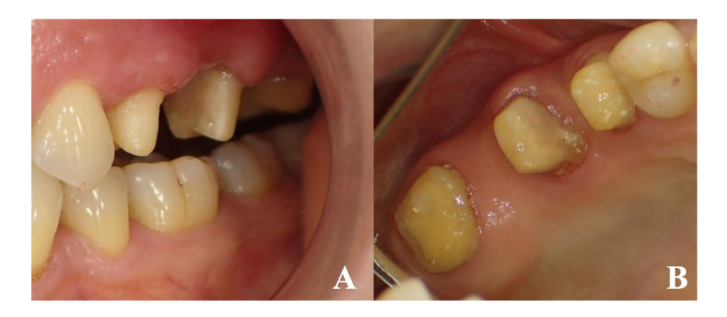
Figure 5. Intraoral view after abutment preparation. (A) Lateral view; (B) Occlusal view