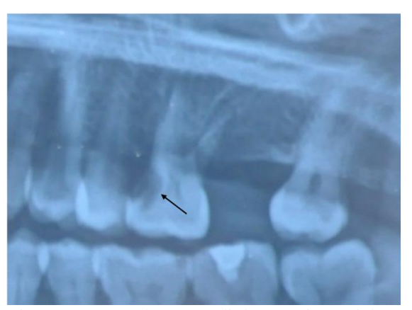
Figure 2. X-Ray shown a radiolucency in mesial 26 reaches the pulp chamber

On the 7<sup>th</sup>day, the stitch was removed and the fiber splint was disassembled. Patient had no complaints after hemisection treatment, so patient was referred back to prosthodontic department. The treatment was continued on abutment teeth preparation which is 25, 26, and 28. The amount of preparation is in accordance with the material to be used, namely PFM on teeth 25, 26 and full metal in teeth 28 because it has difficult access and a short clinical crown. <sup>10</sup> The result of preparation was shown in Figure 5.