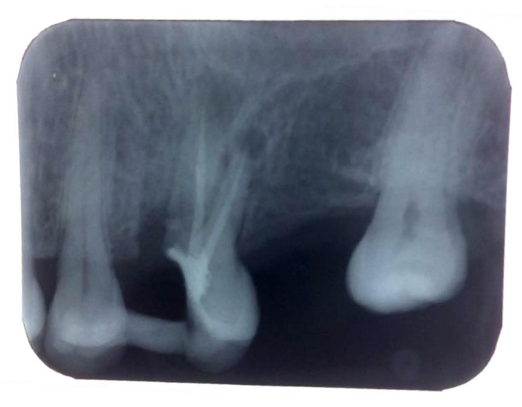
Figure 4. Radiographical images post hemisection with composite resin splinting

Try in coping were carried out, evaluated and sent back to the dental lab for processing porcelain (Figure 6). A week later the patient returned for control. Patients had no complaints, an evaluation of surrounding tissue and occlusion showed good results so that the bridge denture was inserted permanently using Glass Ionomer Cement Luting (Fuji I GC). At the next control visit the patient had no complaints, clinical examination showed good results (Figure 7).